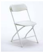
Folding Chair $1.00 - $1.50